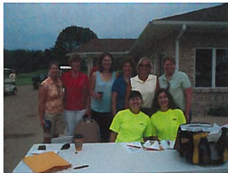
2008 Golf Outing