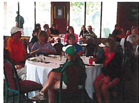
2009 Golf Outing